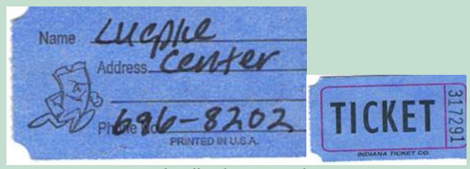
The official winning ticket